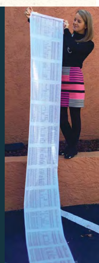
Photo: The fine print on this 8-foot list shows the more than 300 children placed in out-of-home care in our six counties.

Bay | 52 Calhoun | 0 Gulf | 0 Holmes | 6 Jackson | 8 Washington | 7